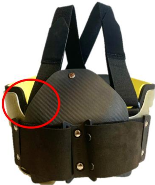
Figure 2 KBP with cut-outs for Female Competitors

In addition to the above and with the purpose of increasing comfort for female competitors, the FIA Standard has specific design requirements for the female KBP which allows cut-outs on the rib protector to ensure comfort and fit around the chest area. Currently there is one female KBP approved by FIA. This information is shown in the TL 87 .