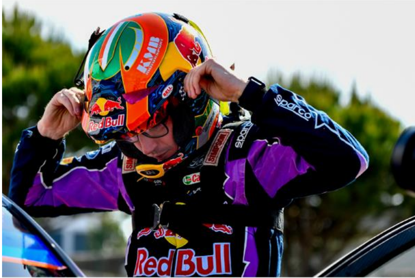
FHR - Helmet Compatibility