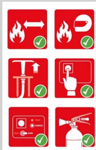
FIA Standards for Extinguishers