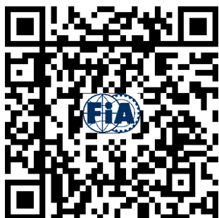
QR Code #1 – Homologated Overalls - Part 1 (Standard 2013-1)

To help competitors access the most effective and reliable protective clothing for karting, the FIA has created two technical lists: the technical list for karting overalls approved according to the CIK-FIA N2013-1 standard, which can be downloaded HERE or by scanning QR Code #1; and TL101 for all karting garments (overalls, gloves and shoes) approved according to FIA Standard 8877-2022, which provides detailed information for each of these karting garments. This document can be downloaded HERE or by scanning QR Code #2.