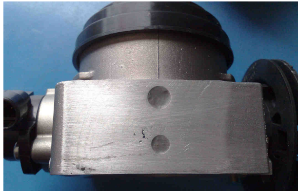
Holes clogged with glue

NOTA: Renault Sport advises you to fill the holes completely and to not forget to clog the holes (air intake pipe side) to prevent from any leakage.