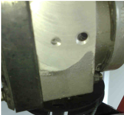
Holes not clogged