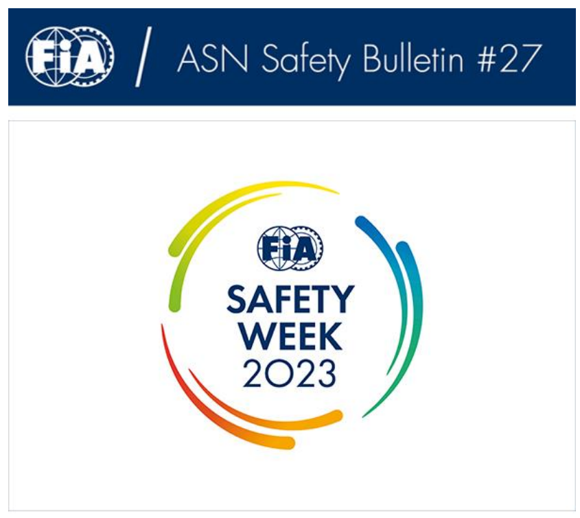
Safety Week - 2023

Please feel free to forward this to anyone you think would be interested in this information, as they can subscribe to future bulletins by clicking the button at the bottom of this email.