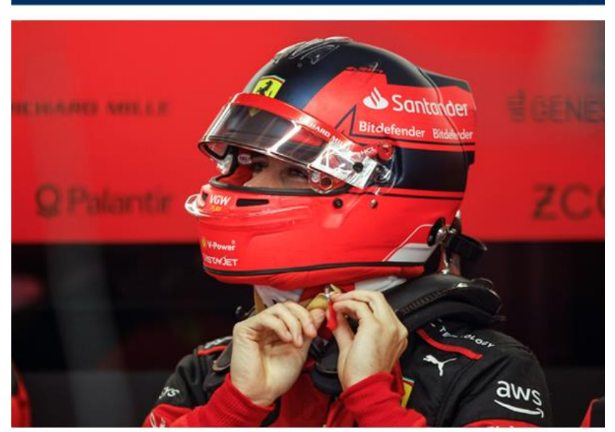
FIA Safety and Medical Regulations