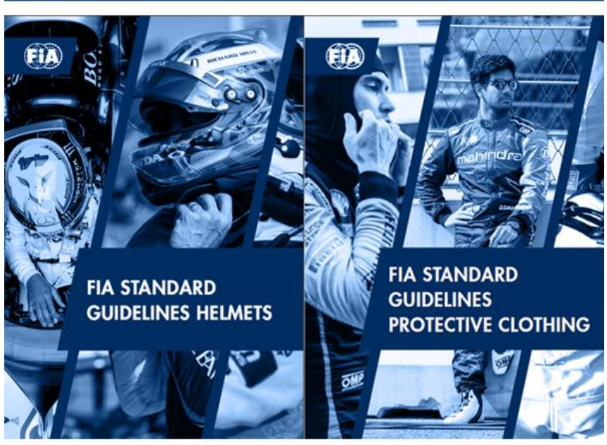
Safety Equipment Guidelines