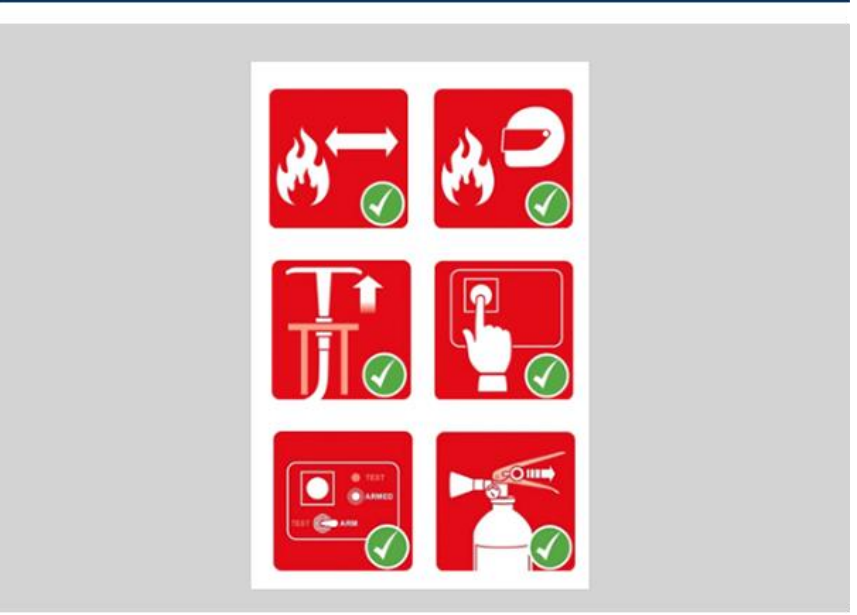
FIA Standards for Extinguishers