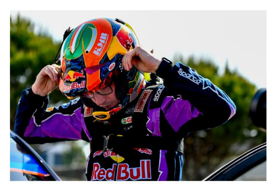
FHR - Helmet Compatibility