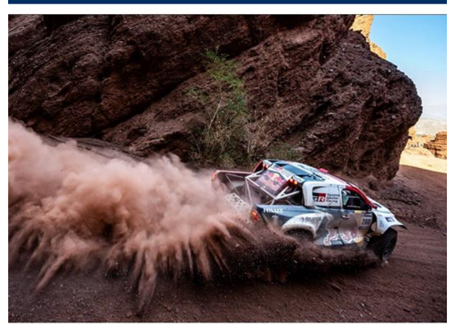
Seat Side Head Support