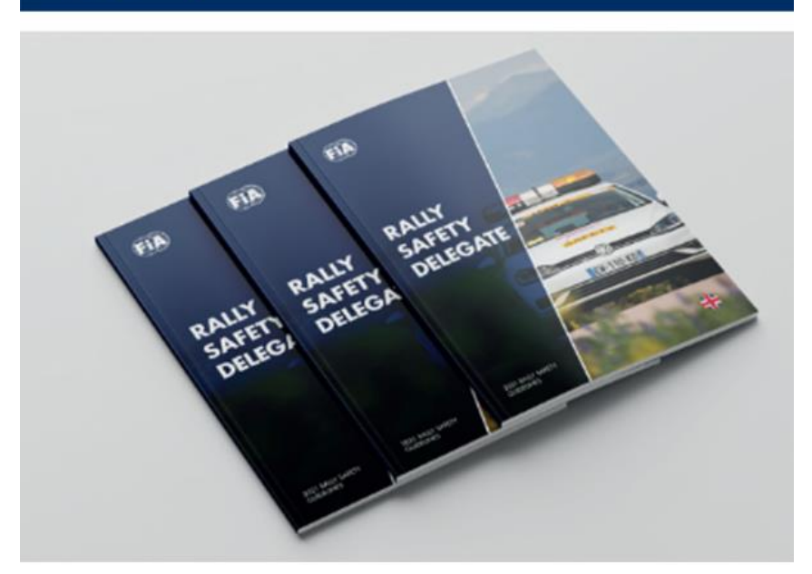
Rally Safety Delegate role