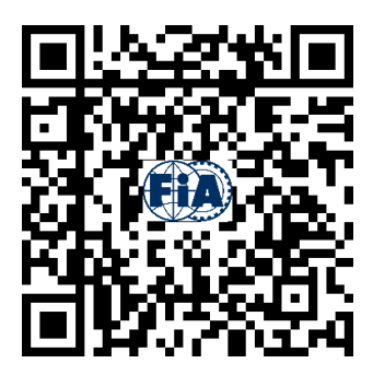
QR Code #1 – Homologated Overalls - Part 1 (Standard 2013-1)

To help competitors access the most effective and reliable protective clothing for karting, the FIA has created two technical lists: the technical list for karting overalls approved according to the CIK-FIA N2013-1 standard, which can be downloaded <u>HERE</u> or by scanning QR Code #1; and TL101 for all karting garments (overalls, gloves and shoes) approved according to FIA Standard 8877-2022, which provides detailed information for each of these karting garments. This document can be downloaded <u>HERE</u> or by scanning QR Code #2.